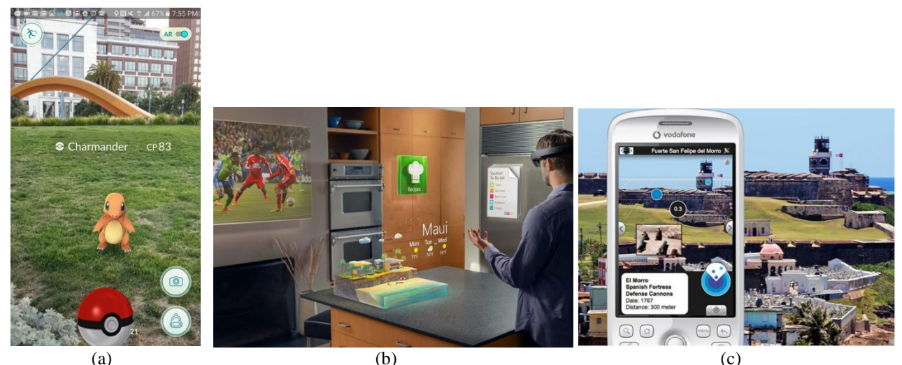
Figure 2: Augmented Reality applications: (a) Pokémon GO [4] – chasing Charmander, (b) Microsoft HoloLens [9] – kitchen use case scenario, (c) layar [5] – using EyeTour application.

other approaches to acquire a user's position and orientation, and (iii) user interface to achieve real-time interaction.