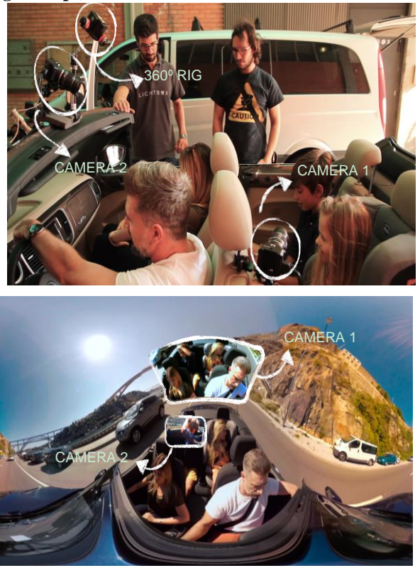
Figure 2: Top: a camera setup to record traditional and omnidirectional video simultaneously. Bottom: a schematic diagram of possible directive inserts located within the omnidirectional video. Image courtesy of Lightbox (www.lightbox.pt).

Figure 1: Top: an image typical of a traditional TV showing a football match. An insert informs the consumer that content is also available for tablets and HMDs. Bottom: a capture of an omnidirectional video with inserts of traditional cameras. This content is delivered synchronized with the main TV stream. Image courtesy of Lightbox (www.lightbox.pt).