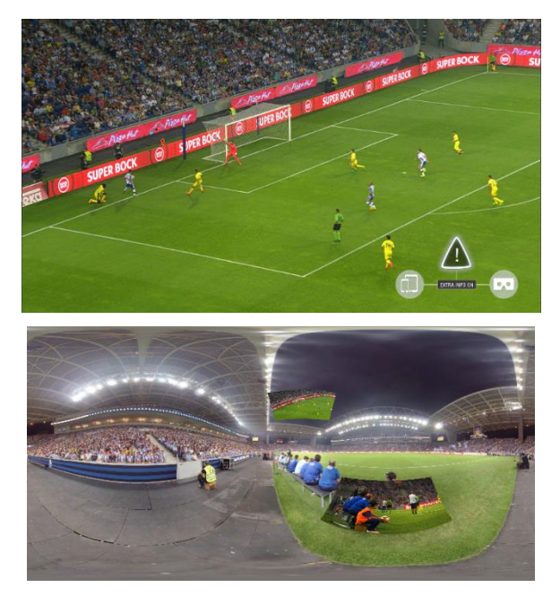
Figure 1: Top: an image typical of a traditional TV showing a football match. An insert informs the consumer that content is also available for tablets and HMDs. Bottom: a capture of an omnidirectional video with inserts of traditional cameras. This content is delivered synchronized with the main TV stream.